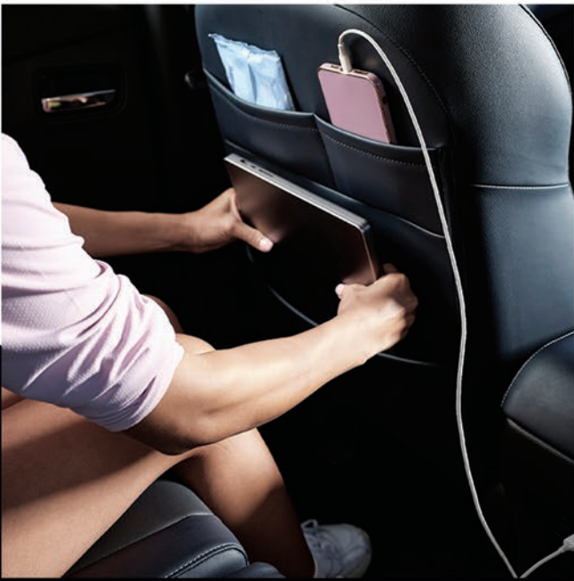
Seat Back Pockets