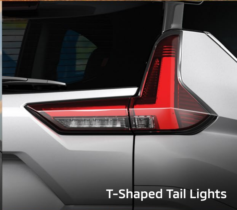
T-Shaped Tail Lights