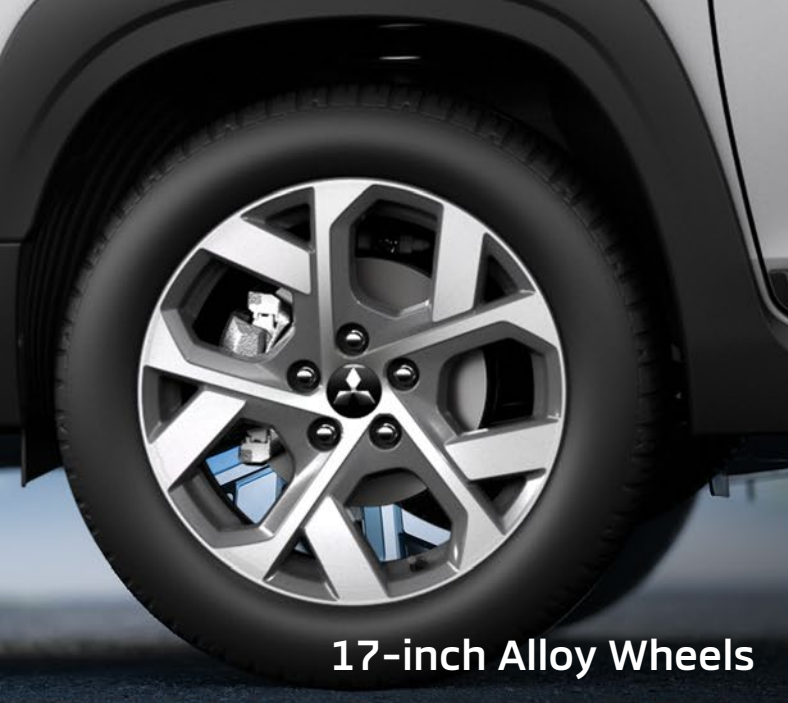
17-inch Alloy Wheels