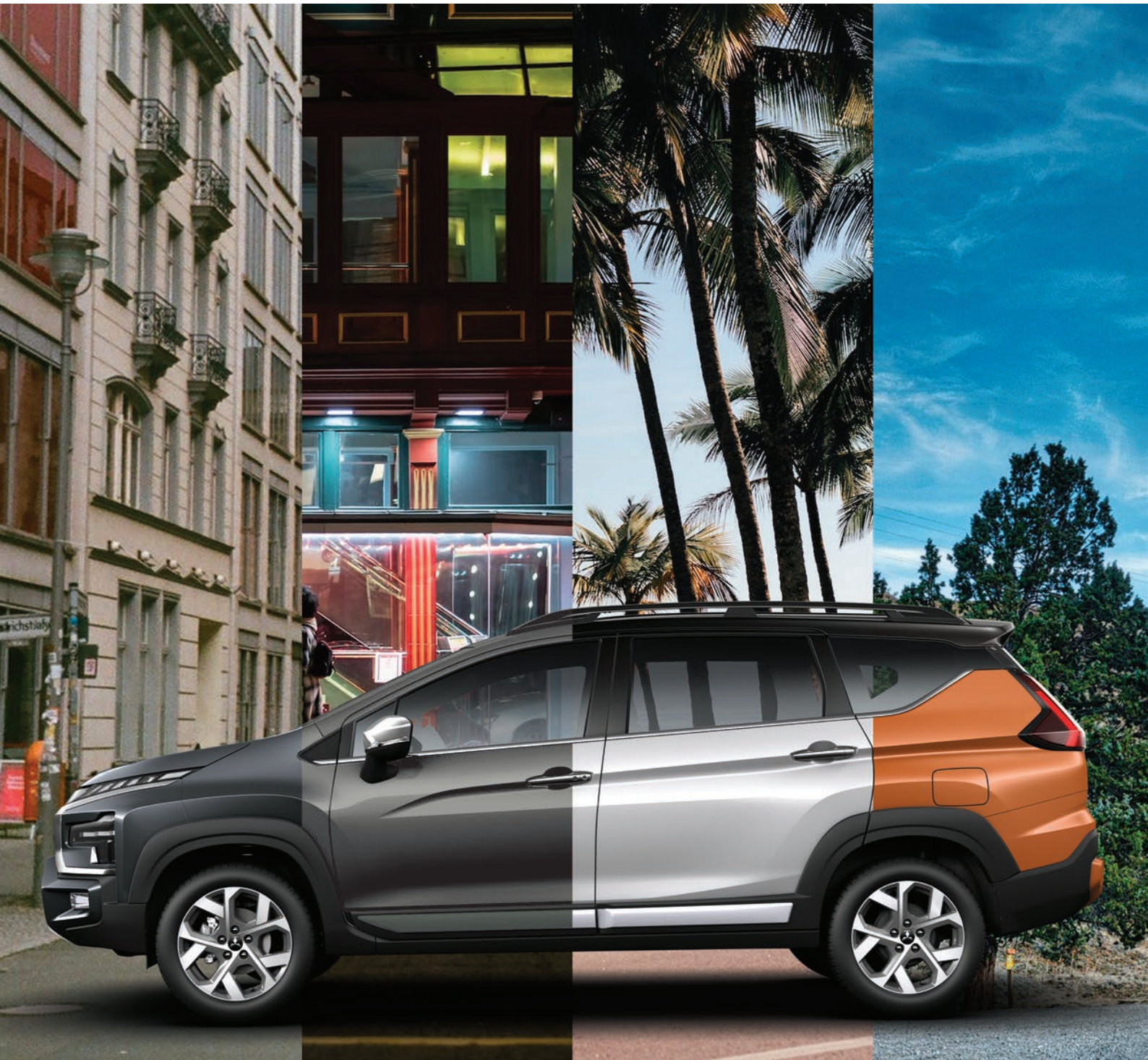
Graphite Gray Metallic (Monotone)