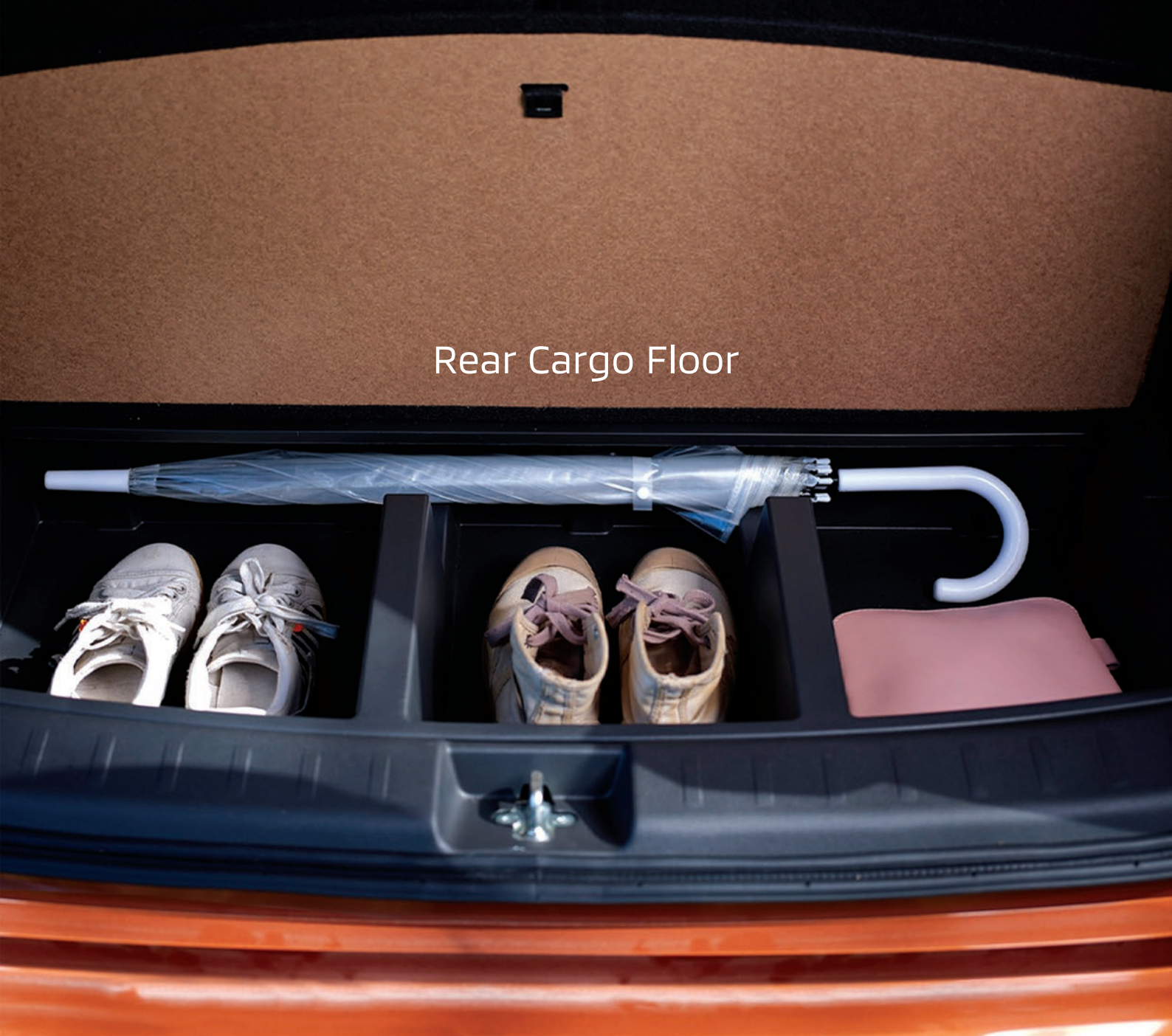
Rear Cargo Floor