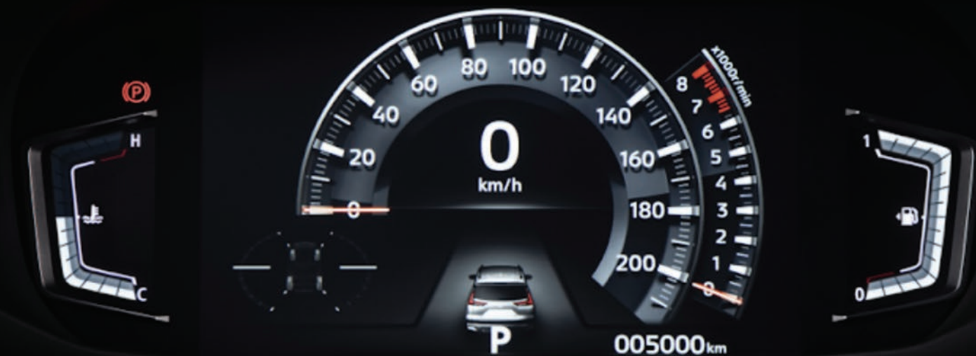
8" Full Color LCD Meter